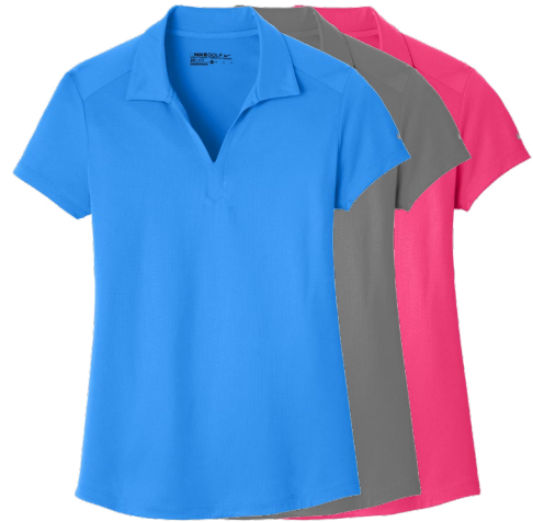
NIKE Ladies Dri-FIT Legacy Polo 838957 Women's Sizes: XS-2XL | 6 colors