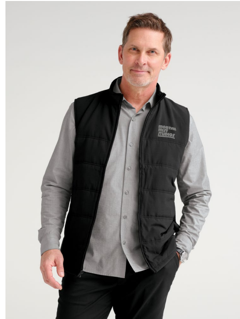
TRAVIS MATHEW Cold Bay Vest TM1MW453 Adult Sizes: S-3XL | 2 colors Worn with MM2000