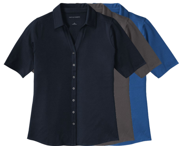
PORT AUTHORITY Ladies City Stretch Top LK682 Women's Sizes: XS-4XL | 5 colors