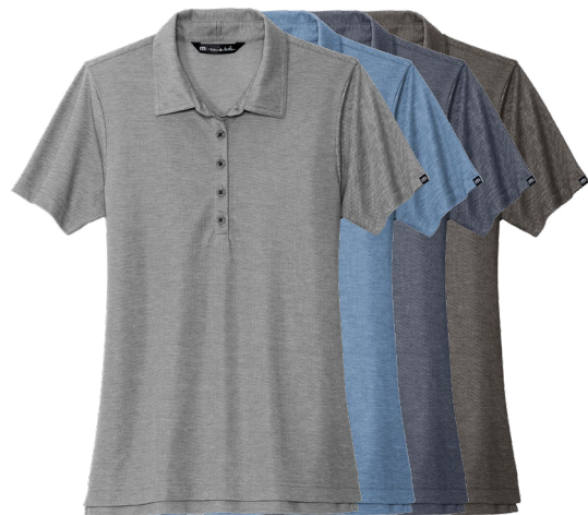
TRAVISMATHEW Ladies Oceanside Heather Polo TM1WW002 Women's Sizes: S-2XL | 6 colors