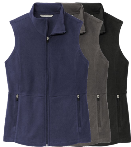
PORT AUTHORITY Ladies Accord Microfleece Vest L152 Women's Sizes: XS-4XL | 3 colors