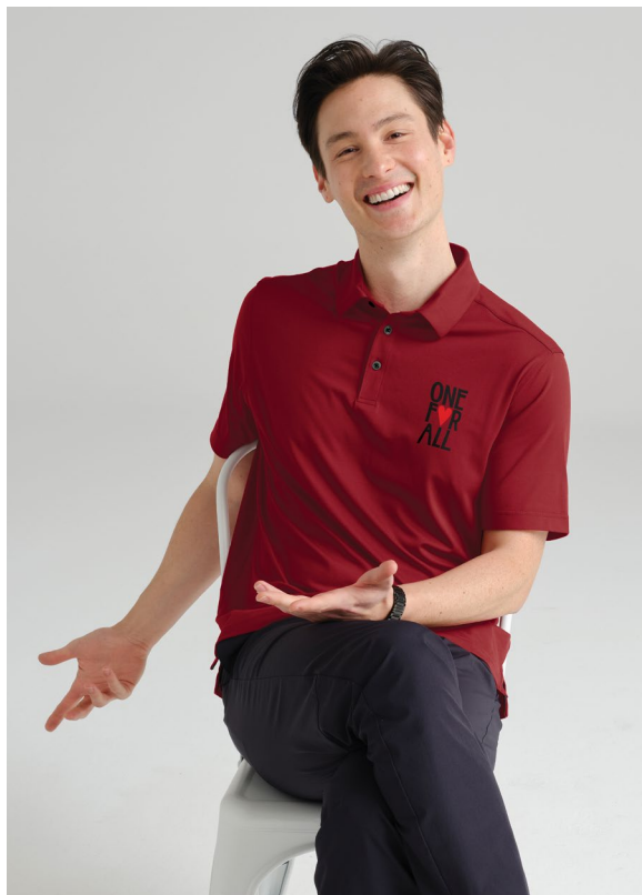
PORT AUTHORITY City Stretch Polo K682 Adult Sizes: XS-4XL | 6 colors